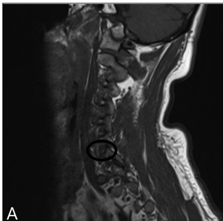
FIGURE 1A: T1 sagittal image.