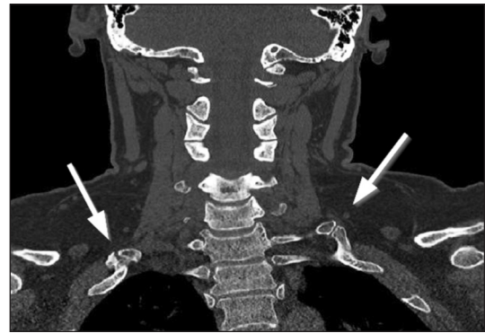
FIGURE 1: Coronal tomography sections reveal pseudoarthrosis between the cervical rib and the extension of the first rib on the left side. The right cervical rib forms a direct pseudoarthrosis with the right first rib (arrows).

Dixit et al. reported on a case with the development of total occlusion in the subclavian vein as