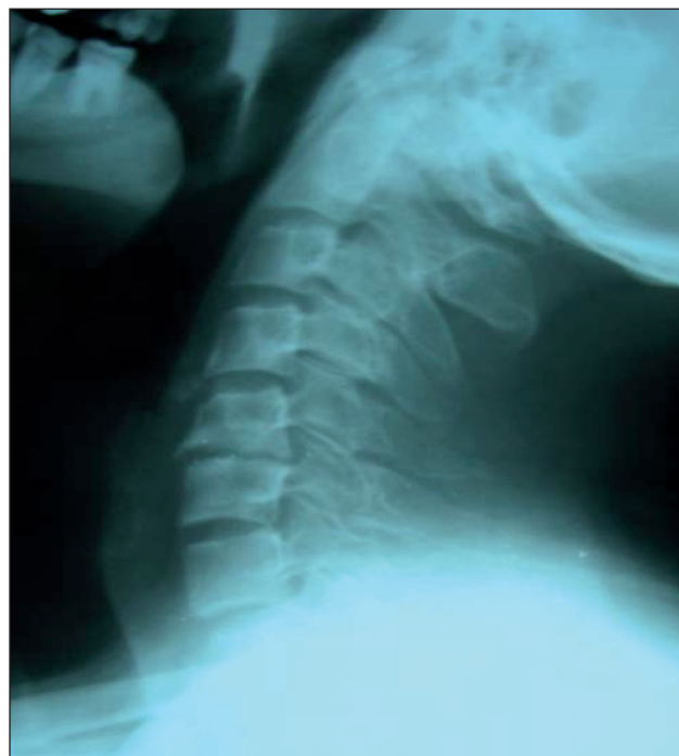
Figure 2. Cervical X-ray demonstrating osteophytes and irregularity at the vertebral end plates adjacent to the C5-6 disc together with C5-6 disc height loss.