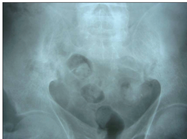
Figure 1. Anterior-posterior pelvic X-ray depicting increased sclerosis and widened joint spaces of the bilateral sacroiliac joints.

increased sclerosis and widened joint space (Figure 1). Cervical spine lateral radiograph depicted osteophytes and irregularity at the vertebral end plates adjacent to the C5-6 disc together with C5-6 disc height loss (Figure 2). On Lateral thoracic radiograph, vertebral osteoporosis, a slight increase in thoracic kyphosis, vertebral osteophytes, and slight irregularity in the vertebral end plates were noticed (Figure 3). Magnetic