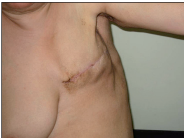
Figure 2. Axillary web syndrome.

Axillary web syndrome, also known as axillary cord, syndrome of axillary adhesion, and cording lymphedema, was first defined by Moskovitz et al. who determined that it generally develops from one to five weeks after surgery and is responsible for a significant decrease in shoulder mobility (Figure 2) (26). The palpable cords that are involved are the lymphatic vessels whose course has been interrupted or occluded during ALND. Pathological assessment found these cords to be sclerosed veins and lymphatic vessels with surrounding fibrosis. The cords might be found only in the axilla, or they could extend distally along the anterior, medial aspect of the arm, or even the palm. The incidence rate differs among authors, which is presumably due to the various diagnostic criteria used in the studies. In a cohort of 85 patients, axillary web syndrome developed in 20% of the patients after SLND and in 72% after ALND, (21) and in a retrospective study of 750 mixed cases, Moskovitz reported this syndrome had an incidence rate of 6%. However, 74% of the patients in that study had a shoulder abduction limitation of 90° (26). Although the clinical course is undefined, this is a benign and non-progressive situation. Home exercise consisting of wall walking, Codman's exercises, stretching and active-assistive exercises, manuel release techniques,