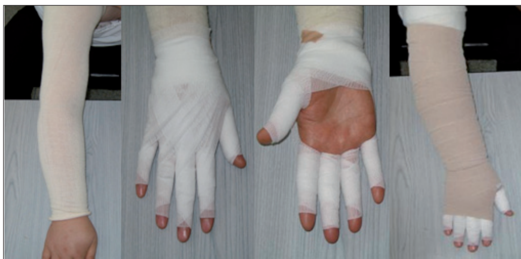
Figure 4. The application of short-stretch and non-elastic compression bandages.