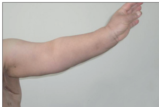
Figure 1. Restriction of shoulder mobility after breast cancer surgery.