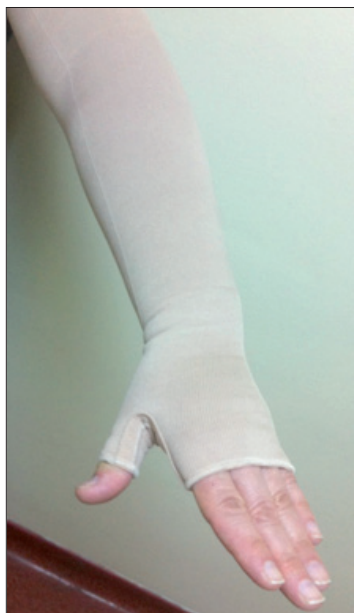
Figure 5. Compression garment for arm.

[45-48]. Strength training should be done progressively. Patients should start with light weights, and their activities should be controlled and supervised at the beginning. The same research that demonstrated that weightlifting was not harmful also showed that upper body exercise for BC survivors with lymphedema as well as those at risk for this condition was also safe. Evidence also exists that indicates that an exercise program for BC survivors consisting of slow progression reduces the symptoms, decreases the incidence of exacerbations of lymphedema, and increases the work capacity of the limb (48-51).