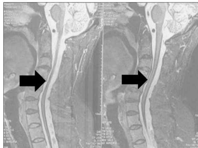
Figure 2. MR imaging revealed significant central myelopathy and atrophy of spinal cord especially in C7 level