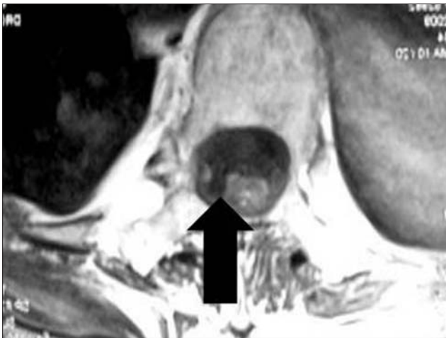
Figure 3. Transvers MR imaging revealed significant dural ectasia and vertebral scalloping

In marfan patients defective microfibrils that cause weakening and incompetence of the dural sac are the causes of dural ectasia. Dural ectasia is the widening of the spinal canal and neural foramina with evidence of posterior scalloping of